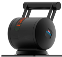
RSCU - H

Whether it concerns a waterjet or azimuth thruster, the speed and 360° angle rotation control units are designed to fit ergonomically in every operator's hand. Highly precise manoeuvring due to the accurate control and direct feel.