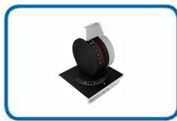
BUK-I azimuth propulsion