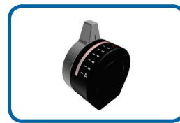
BUK-I bow thruster